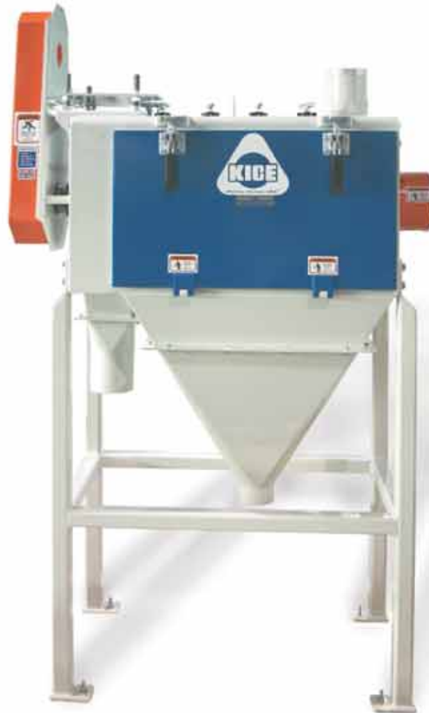
Bran Finishers KICE DATA SHEET | BF-2